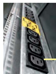
High-performance power supply