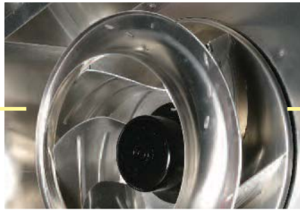
Optimum ventilation, temperature-dependent and speed-controlled