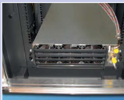
CoolTherm® 4-8 kW for low heat loads