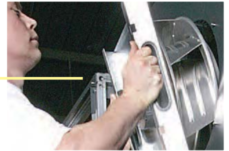
Easy fan exchange while doors remain closed